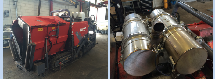
Figures 3 and 4: The asphalt paver with the DPF+SCR solution, developed by Purefi A/S

In addition, the average measured PN concentration downstream DPF+SCR is about a factor of 5-10 below the PN reference value being suggested by the Swiss Federal Office for the Environment FOEN (2.5x10 5 particles/cm 3 ), for passing a DPF test. This reference value is analogous to the proposed limit in the future Stage V standard (1x10 12 particles/kWh), but is much easier to measure on-site. Interestingly, a significant amount of the particles measured downstream DPF+SCR have a size below the PMP limit of 23 nm, as also seen in figure 6.