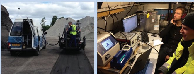
Figures 1 and 2: Experimental setup with measurement equipment inside the van driving next to the selected asphalt paver on a test facility

Gas emissions (CO, CO 2 , THC, NO, NO 2 , NO x , NH 3 , and N 2 O) are measured using Fourier-Transformed Infrared Spectroscopy (FTIR).